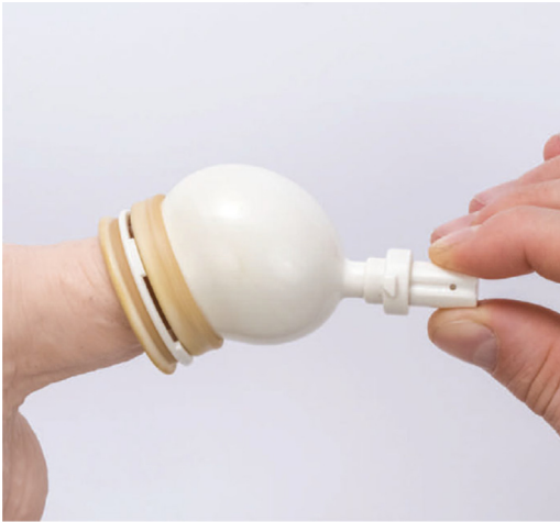
Fig. 1. PeniMaster PRO device characterized by its unique vacuum-based glans fixation mechanism. 20 (From Moncada I, Krishnappa P, Romero J, et al. Penile traction therapy with the new device 'Penimaster PRO' is effective and safe in the stable phase of Peyronie's disease: a controlled multicentre study. BJU Int. 04 2019;123(4):694-702. https://doi.org/10.1111/bju.14602 .)

following innovations: (i) a wide penile clamp design, (ii) counter-bending, (iii) dynamic adjustment (Fig. 2). The device was evaluated in a pragmatic clinical trial, including a "true to life" PD population and an intention-to-treat analysis. 21 Men with PD were randomized 1:3 to no therapy or RestoreX for 30 minutes 1 to 3 times per day for 3 months. Adult men with curvature greater than 30° were included, and only those with an SPL <7 cm or severe diabetes were excluded. The primary study outcome was safety. Penile curvature, SPL, and IIEF scores were assessed as secondary outcomes. 21 At the study conclusion, data were available for 63 men in the PTT arm and 27 men in the control arm. No moderate to severe adverse events were reported. Mean primary curvature decreased 18%, and SPL increased a mean of 1.5 cm in the traction arm, both statistically significant compared with placebo. In men with baseline ED (defined as international index of erectile function [IIEF-EF] ≤25), RestoreX improved erectile function (mean 4-point improvement in the IIEF-EF). 21